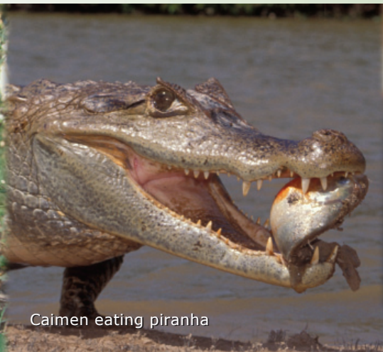
Caimen eating piranha