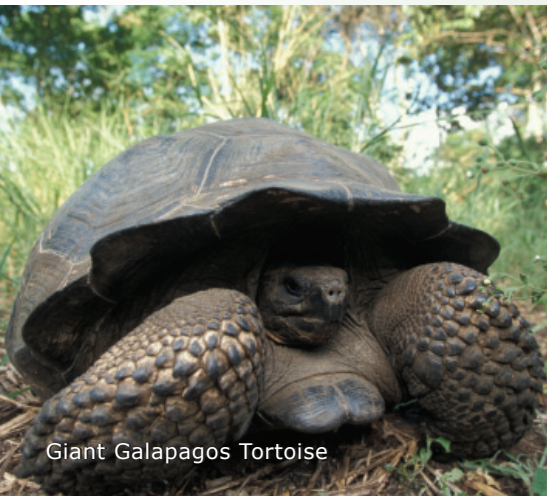
Giant Galapagos Tortoise

Live amphibians are featured in each program.