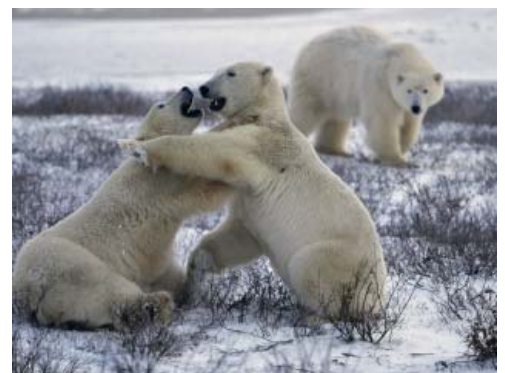
Polar bears, Canadian Arctic

The future of polar bears and many other species of wildlife is directly related to energy consumption. Practical ideas for reducing our impact on the environment are covered.