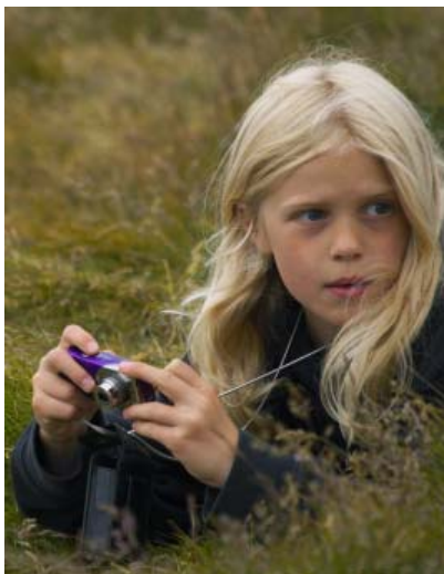
Girl photographing wildflowers

Humans connect with those things they love and understand. Forming a positive attitude about nature at an early age is vital to maintaining an environmentally friendly culture. This program gives examples of how students can "connect" in a positive way to nature.