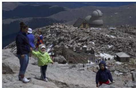
Family hiking on Mt. Evans, Colorado

How we live on a day-to-day basis greatly impacts the environment.